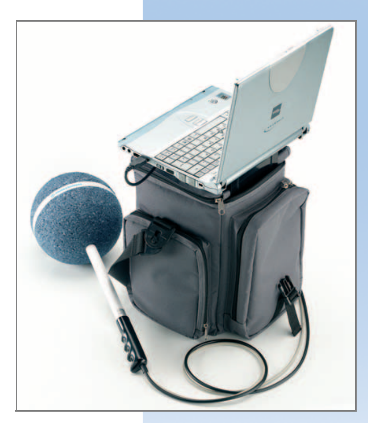
R&S TS-EMF system with R&S FSH3 carrying bag