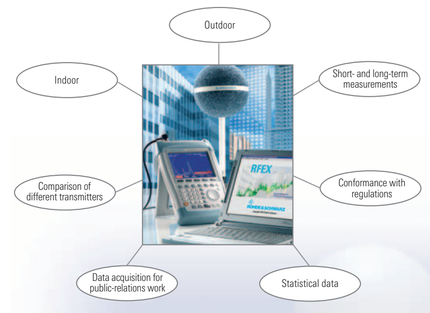
R&S TS-EMF applications

BLUETOOTH is a trademark owned by Bluetooth SIG, Inc., USA and licensed to Rohde & Schwarz